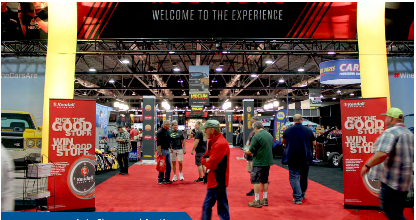
Auto Shows and Auctions

Check out our extensive list of catering options to keep your event guests delighted!